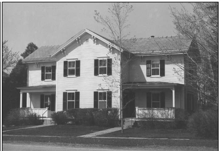
Figure 2. 1977 Historic survey photo.