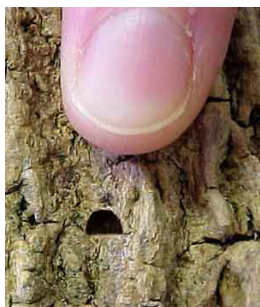
"D-shaped" exit hole

Affected trees will gradually lose foliage from the top down until they eventually are unable to produce leaves. This is a rapid process and trees that seem to be in decent health going into the winter may be observed not producing any leaves the next spring. Routine tree trunk insecticide injections can increase the longevity of high-value trees for a number of years, but they cannot reverse damage already done.