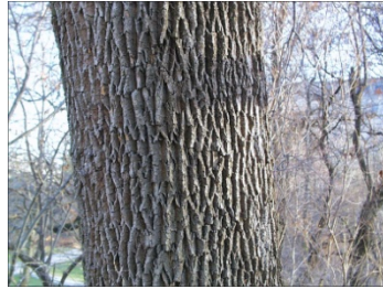
Mature ash bark