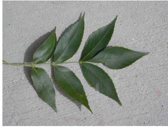
Green ash compound leaf

Ash trees are most easily identified by their compound leaves (composed of 5-11 leaflets) and opposite branching pattern, where twigs and buds grow directly across from each other as opposed to staggered or alternate branching. The bark on mature ash trees is tight with a distinct pattern of diamond-shaped ridges, while the bark on young trees is relatively smooth. The only other tree species with an opposite branching pattern and compound leaves in this area is the boxelder ( Acer negundo ), which almost always has three to five leaflets.