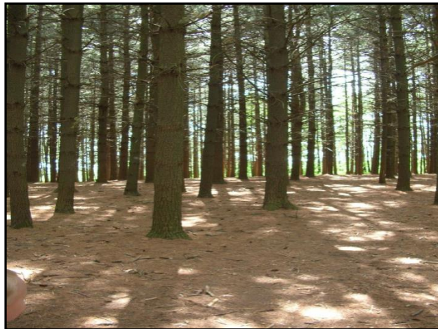
White Pine Forest