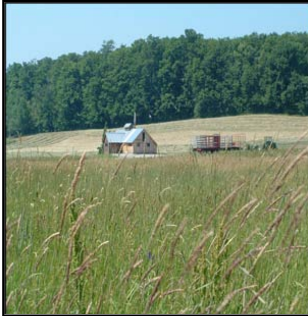
Sugar House & Sugar Bush

Highlights of this trail include a beautiful small pond and a small wooded knoll from which you can see wonderful views of Bolton Valley, Mount Mansfield, and Camel's Hump to the east. Views from the west include Lake Champlain, Shelburne Pond, Brownell Mountain, and the New York Adirondacks.